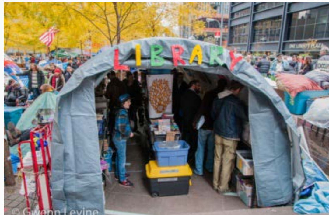
Occupy Wall Street “The People’s Library at Zucotti Park”

Throughout 2021, the MCNY community continued to innovate to support our students and advance our mission. In addition to what I have already described, other examples of their collective efforts include: